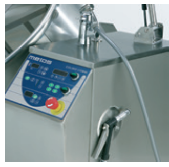
Culino and Culino Combi can be equipped with a hand shower.