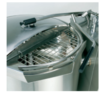
A lift off safety grid enables continuous view into kettle and adding of ingredients, water and spices while the mixer is activated.