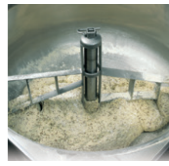
Culino Combi kneads doughs in a matter of minutes.